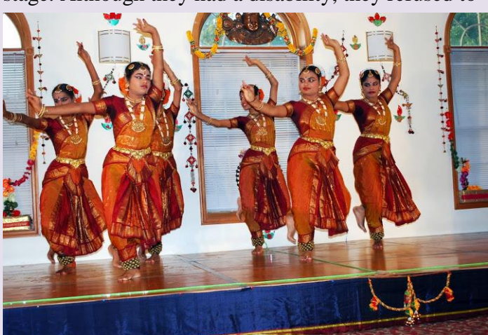
let that disability hinder their passion for dancing. With each one of the mudras and expressions

folk dances. This group of differently abled girls brought their love and passion for dance on to the stage. Although they had a disability, they refused to